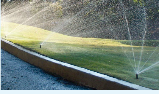
Sprinkler heads are only directed towards grass so that the pavement is not being watered.

2. Make sure your sprinkler heads, when extended, rise above the height of the grass for uniform coverage. Use taller heads in flower and shrub beds. Check that sprinkler heads are not tilted or broken.