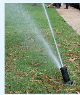
Improperly functioning rotor sprinkler head