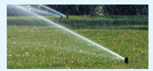
Properly functioning rotor sprinkler head